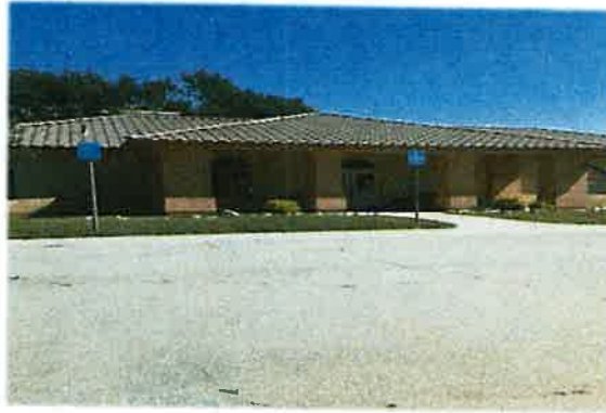
New playground equipment and CSD Library