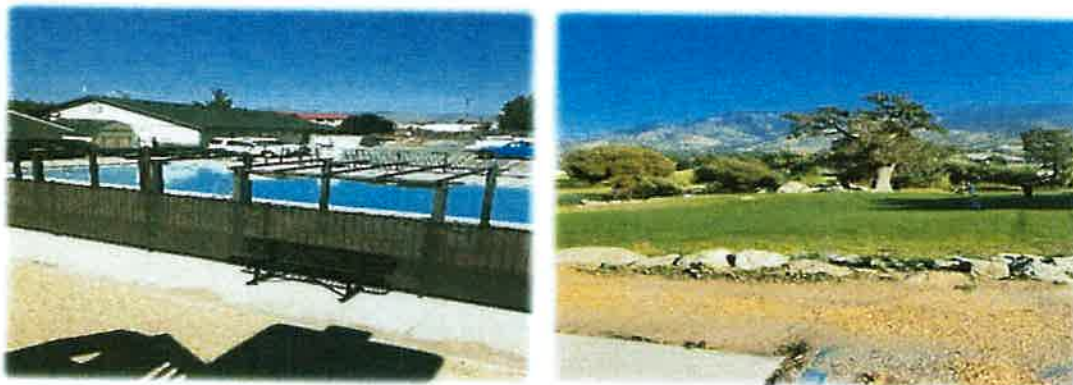
CSD pool and Horsethief Park picnic area

The CSD provides water, trash, green waste, sewer, police, road maintenance, snowplowing and weed abatement. It also has a Parks and Recreation department with a pool, gym facilities and a lake for fishing. New playground equipment was gifted from a neighboring community with a Proposition 68 Grant for both Horsethief and Man O'War parks. A library staffed by volunteers is in a new facility at the edge of town. Although the fire station is owned by the CSD, it is staffed by the Kern County Fire Department.