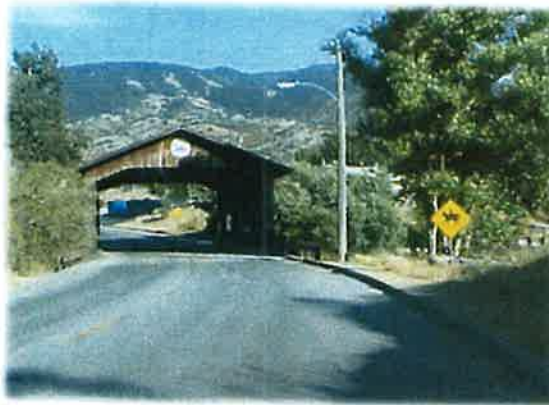
Stallion Springs Oktoberfest and iconic Covered Bridge