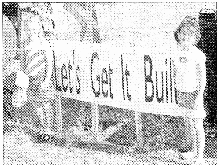
Two of the 200 residents attending the groundbreaking ceremony